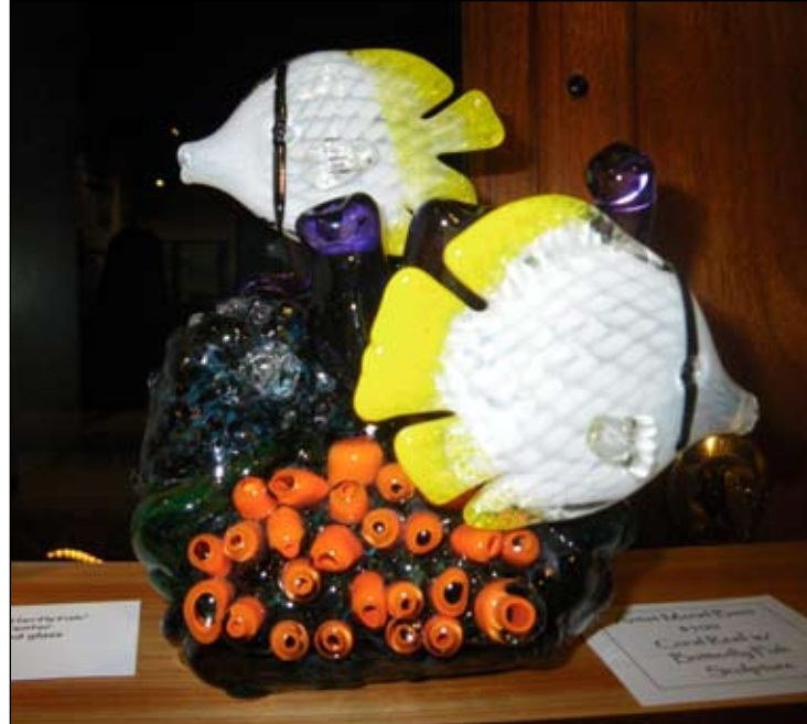
Tradewinds News